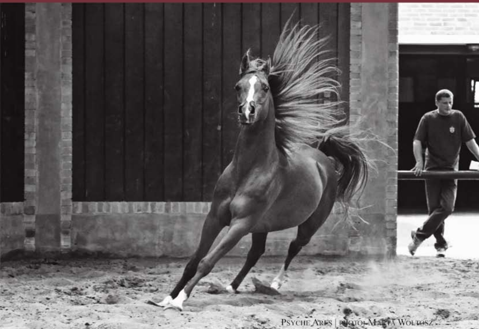
PSYCHE ARES