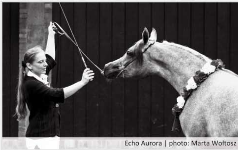
Echo Aurora | photo: Marta Woltosz