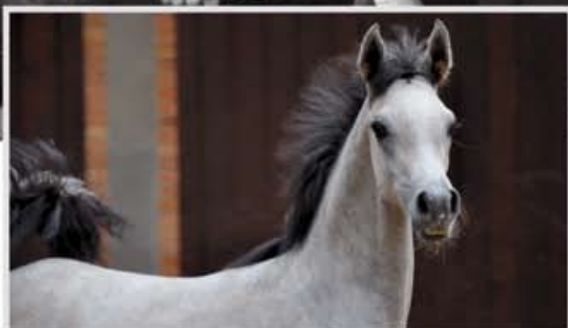
Echo Dionizos

own stallions – Echo Adonis (Al Maraam x Echo Kallisto) and Psyche Ares (Ekstern x Pallas-Atena). Interesting appearance in the group of 15 horses presented was the famous and most entitled at Chrcynno - Psyche Victoria with very promising colt by Khidar or well known from the show rings Ganga (Emigrant x Granada) with beautiful colt by Psyche Ares.