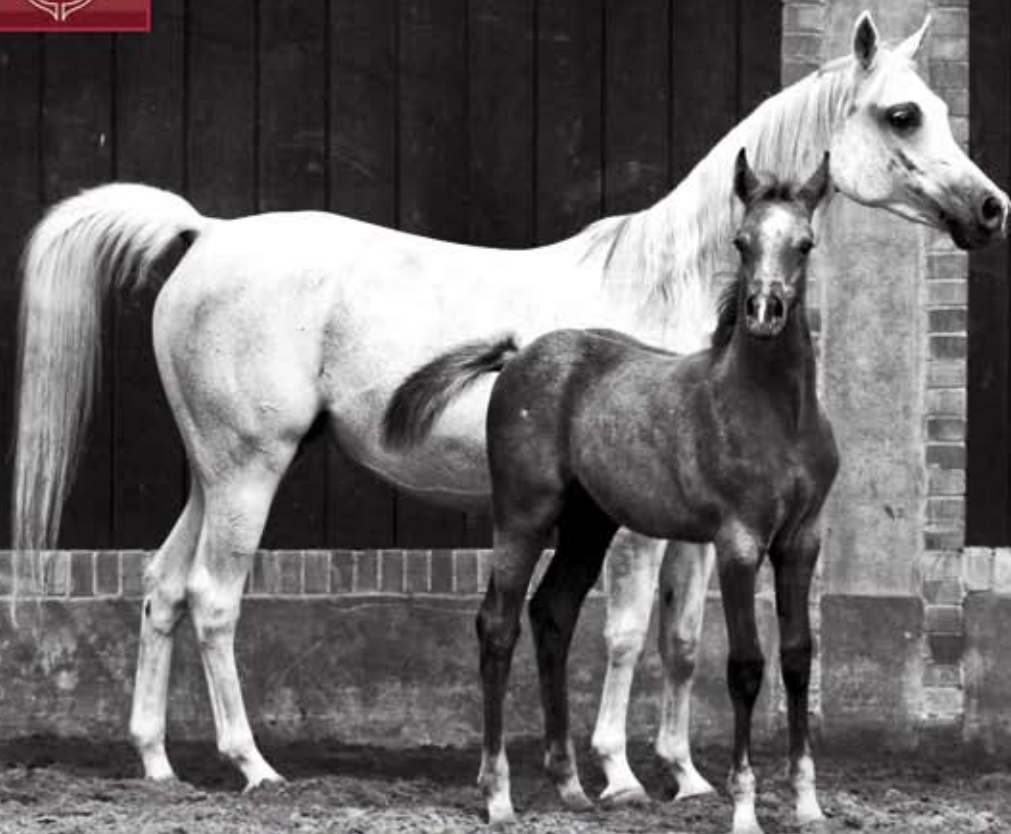
PALLAS-ATENA WITH COLT PSYCHE QZYRAS