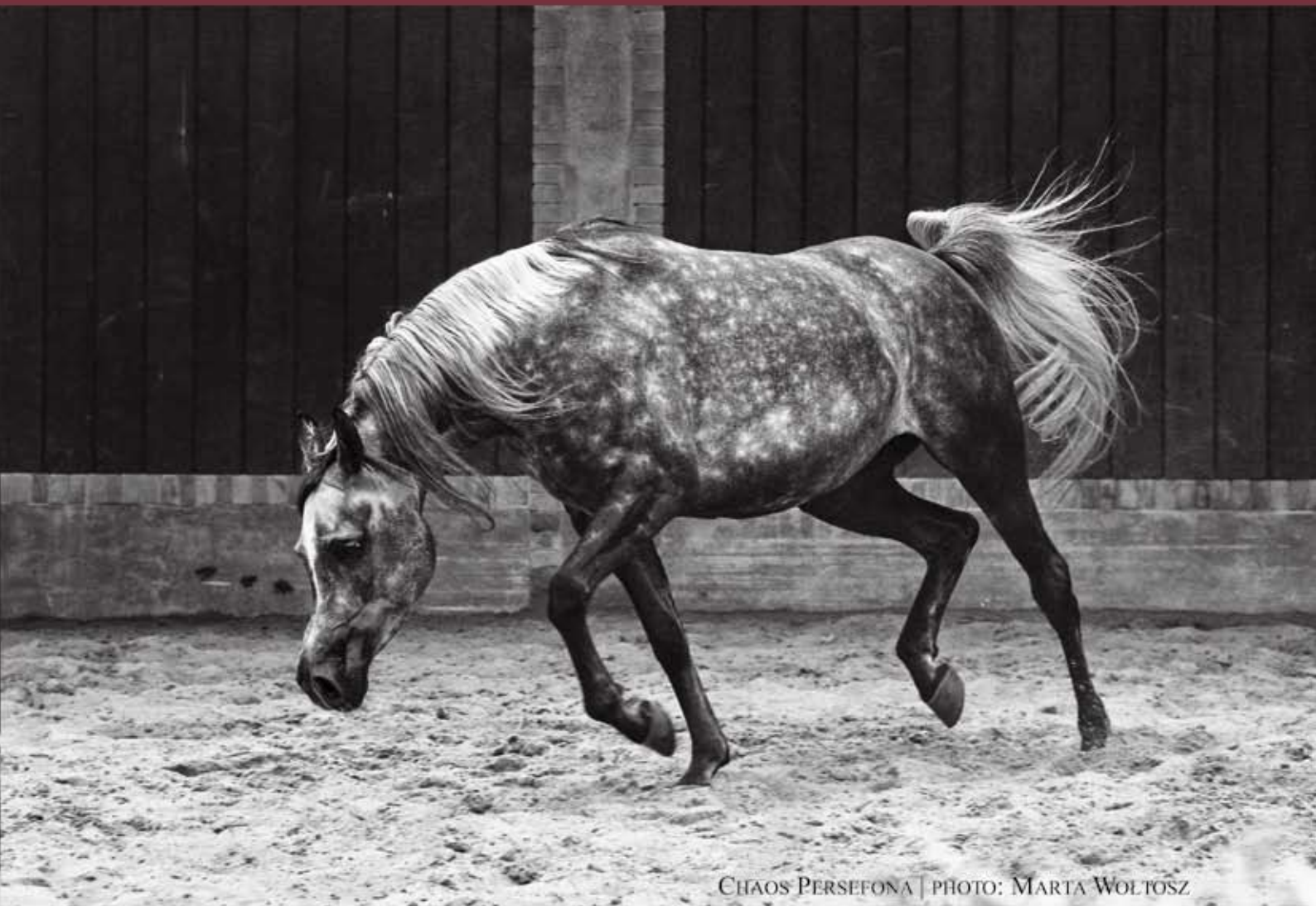
CHAOS PERSEFONA